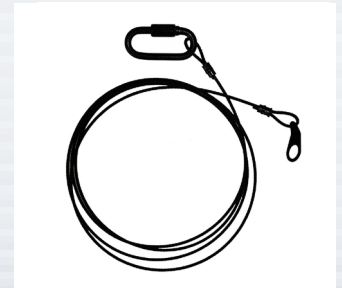
Safety Cable Included