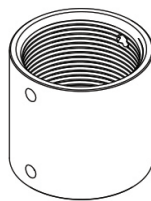
1-1/2" NPS Pipe Coupler