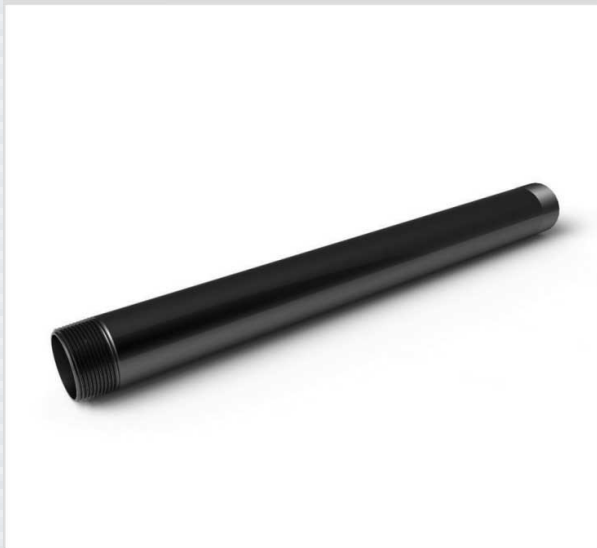
Threaded and Painted