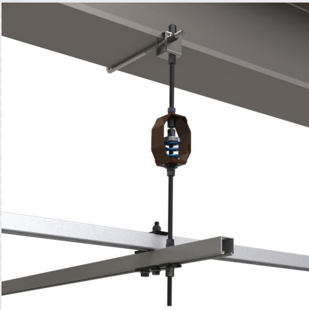
Beam Clamp & Isolator Supporting a Grid