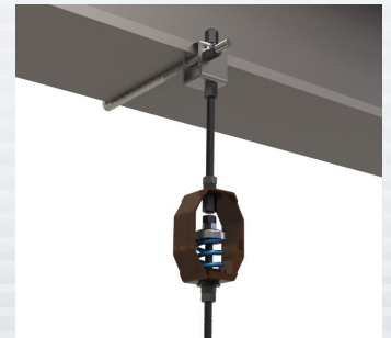
I-Beam Clamp with Sound Isolator

This beam clamp model provides a fast, easy and safe way to rig direct loads, bridles and hitches from overhead and a hand wrench is all that is required to secure this clamp. The beam flanges must be parallel to the floor. secure this clamp. The beam flanges must be parallel to the floor.