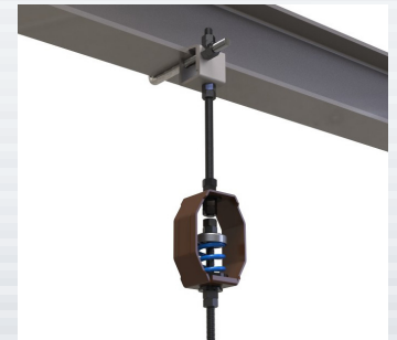
I-Beam Clamp with Sound Isolator

This beam clamp model provides a fast, easy and safe way to rig direct loads, bridles and hitches from overhead and a hand wrench is all that is required to secure this clamp. The beam flanges must be parallel to the floor.