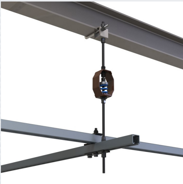
Beam Clamp & Isolator Supporting a Grid