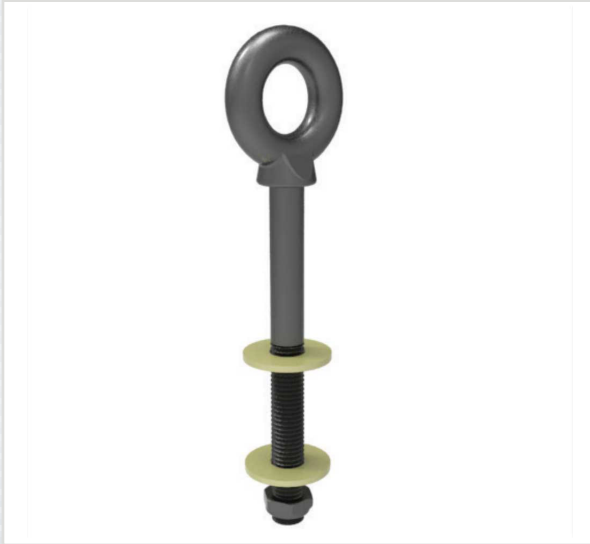
Wall Mounted Line Array

The SAS-EB-KT eyebolt suspension kit is used to create a hang point for Adaptive Rigging Beams such as the Gridlink system and Two Way Arrays.