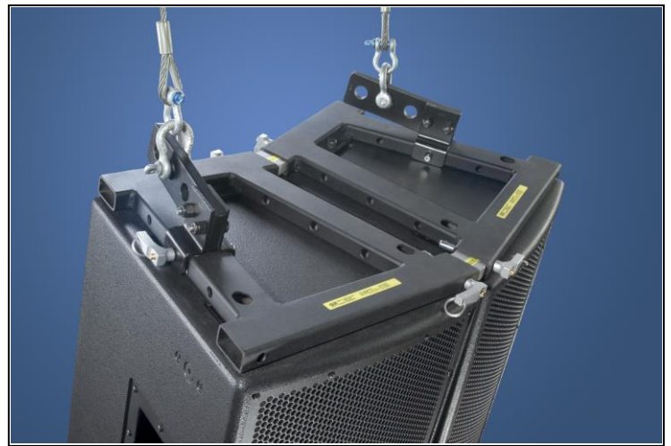
AMFS-1x2-SME Shackle Mount Extended using Quick Release Pin

Check all connections before suspending the speaker cluster.