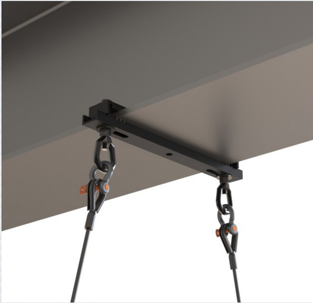
Dual Off-Set Suspensions