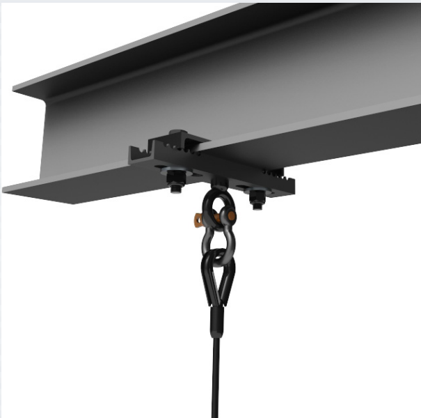
Swiveling Hang Point