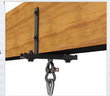
Wood Beam Adapter BC-LAM-KIT

A variety of spacers are included in the kits to accommodate beam flange thickness from .1875 to 1.0" (5mm to 25mm) and the only tools that are needed to install the clamp is a 1.0" and a 7/16" hex wrench.