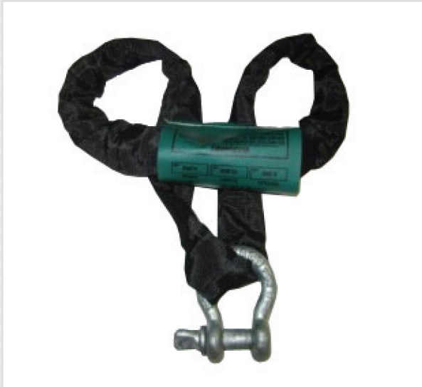
Choker Suspension with Shackle

Steel band round slings are used to suspend objects such as loudspeakers and video walls from overhead lighting truss, structural beams and pipe. Its internal cord is constructed using galvanized steel aircraft cable wound in an endless configuration, which lends itself for high working loads and fire-safe installations. Its soft external fabric cover is easy to handle and protects the finish of suspended surfaces. Its black color blends in with theatrical applications.