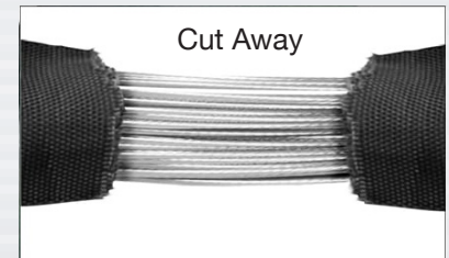
Steel Core Construction

Steel band round slings are used to suspend objects such as loudspeakers and video walls from overhead lighting truss, structural beams and pipe. Its internal cord is constructed using galvanized steel aircraft cable wound in an endless configuration, which lends itself for high working loads and fire-safe installations. Its soft external fabric cover is easy to handle and protects the finish of suspended surfaces. Its black color blends in with theatrical applications.