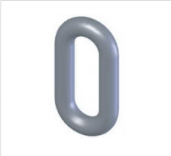
Weldless End Link

Weldless endlinks are produced from a single piece of metal so there is no chance for weld failure. This high strength load-rated link is ideal for use in coupling multiple span sections together, such as wire rope and rigging chain. Multiple sections of wire rope and rigging chain link together, using shackles. Its oval shape is designed for in-line use and is not to be side loaded.