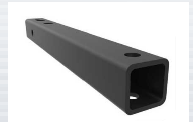
11" Extension Arm replaces standard 6" Arm

This Arm Installs in place of the standard 6" Arm that comes with the MM-060 Speaker Mount.