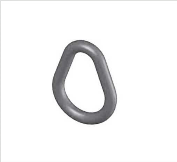
Weldless Pear Link

Weldless sling links are produced from a single piece of metal so there is no chance for weld failure. This high strength load rated link is ideal for use in bridling two points (from the wider end), at angles from a third point (at the narrower end), such as with shackles or wire rope assemblies.