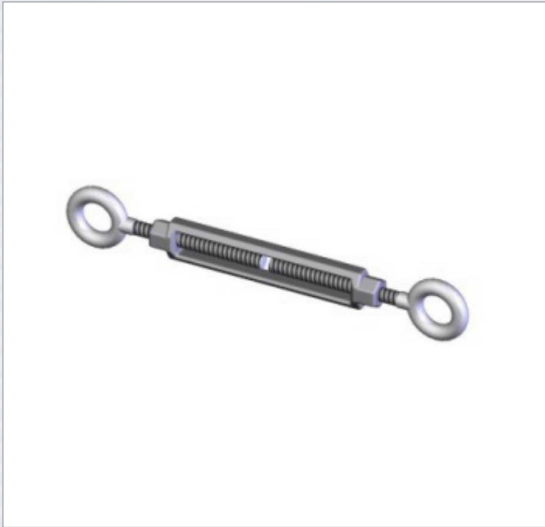
Leveler / Tensioner

Turnbuckles serve as a load-rated tensioning and leveling device. For tensioning, one end always comes with a reversed thread so that when it is placed into service between two objects in its fully extended position, the housing may be rotated back to shorten the overall component, pulling the threaded arms in and putting additional tension into the system, such as between two anchored wire rope assemblies. Turnbuckles are also employed as leveling devices to bring overhead truss and grids into a level attitude. Its eye fittings accommodate shackles, quick links, etc.