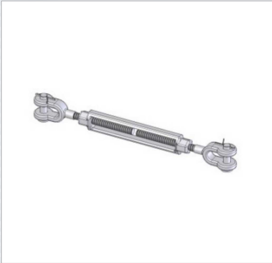
Leveler / Tensioner

Turnbuckles serve as a load-rated tensioning and leveling device. For tensioning, one end always comes with a reversed thread so that when it is placed into service between two objects in its fully extended position, the housing may be rotated back to shorten the overall component, pulling the threaded arms in and putting additional tension into the system, such as between two anchored wire rope assemblies. Turnbuckles are also employed as leveling devices to bring overhead truss and grids into a level attitude. Its clevis fittings accommodate wire rope assemblies, rigging chain and other closed end devices.